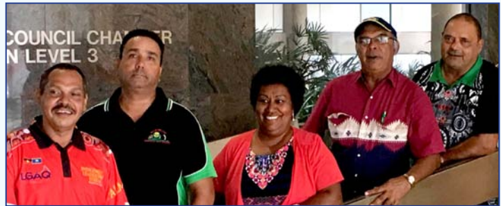
Palm Island Councillors meeting with other Councils in Cairns last month.