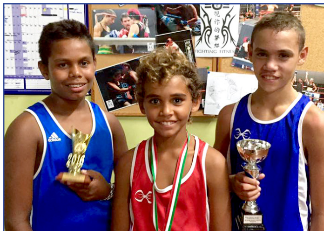
Palm Island boxers won two out of three last weekend in Townsville...